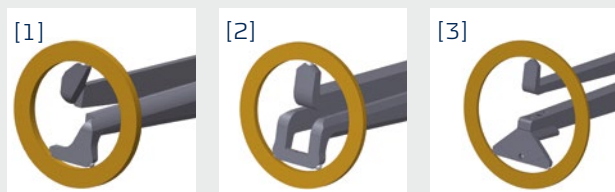
Ball Ø 0.6 mm